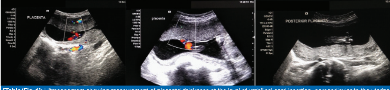
[Table/Fig-1]: Ultrasonogram showing measurement of placental thickness at the level of umbilical cord insertion, perpendicular to the uterine wall excluding the uterine myometrium and retroplacental veins. [Table/Fig-2]: Ultrasonogram showing anterior location of placenta. [Table/Fig-3]: Ultrasonogram showing posterior location of placenta. (Images from left to right)

Suresh K K and Ajey R Bhagwat, Ultrasonographic Measurement of Placental Thickness and its Correlation with Femur Length