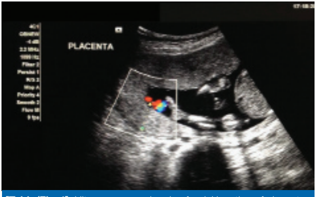
[Table/Fig-4]: Ultrasonogram showing fundal location of placenta.

4. Lateral Placenta: Placenta located laterally and extending equally into anterior and posterior walls [Table/Fig-5].