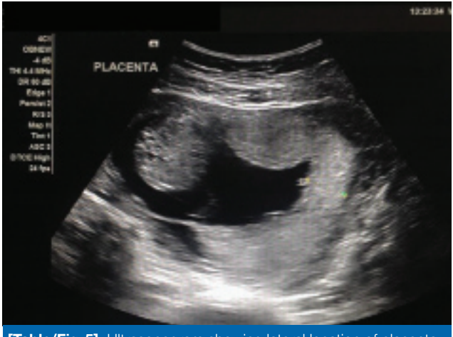
[Table/Fig-5]: Ultrasonogram showing lateral location of placenta.